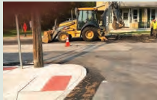
Milling and paving on Main St and Chestnut. Line painting on Main and ADA Ramps on Barrall St.

Council requested the sub-committee to review E. Main Street at Poplar Street and Broad Street for 'Sight Triangles' since those intersections are often the origin of periodic traffic safety discussions.